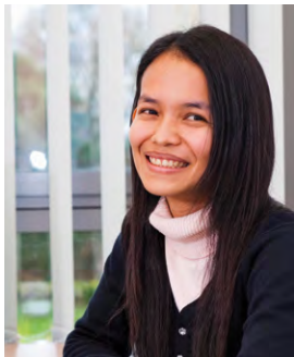
Skulrat from Thailand

“I was very happy to participate in the Quality Engineering course. All the professors, staff and students were very friendly and helpful, and the study support system OSCA was very useful. I learned many new things in the technical modules, and it was a pleasure to master tasks with practical applications. I took part in many activities for students where you can meet new friends. The course was a good opportunity to study not only engineering moduls, but also English and German.“